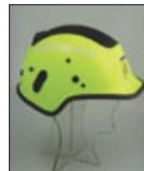
R7HVP Extended Front Peak