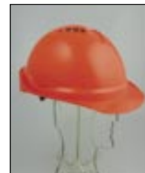
Nikki Helmet Plastic Hardhat