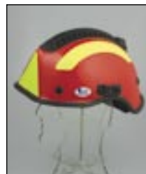
R7HVS Scallop Shell for Fitting Ear Muffs