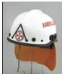
R5 Scallop Shell No Brim