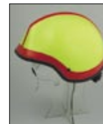
R7G Dennie Stripe Paint Design Illustrated