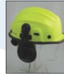
BR9SC (Scoloped, No Brim)